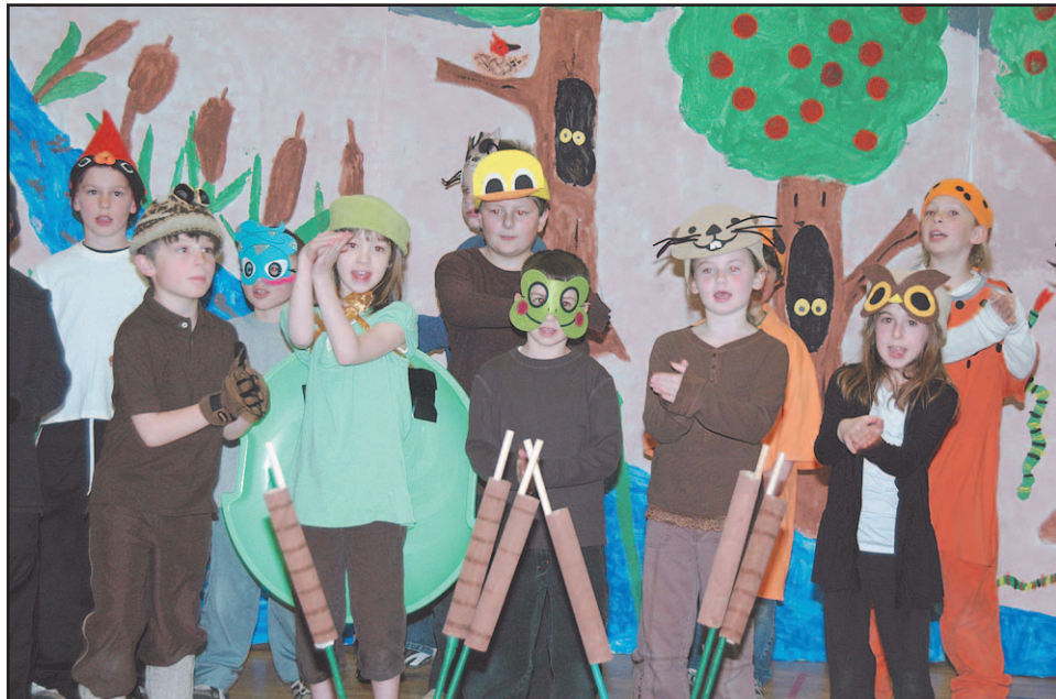
2nd graders presented a delightful play that addressed bullying.