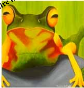
1. Curious Critter

$750 a year for four years New Hampshire Institute of Art Scholarship