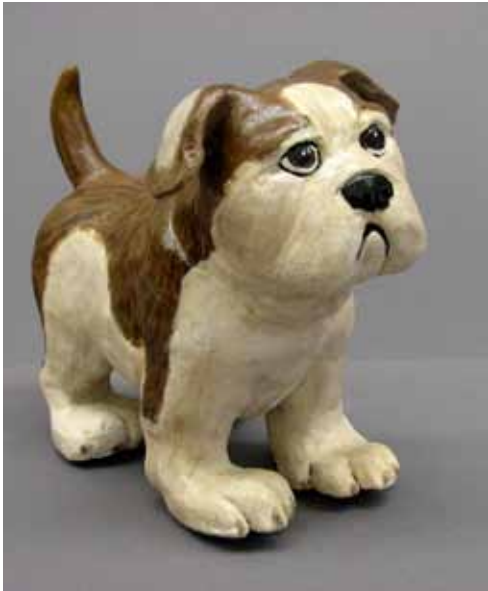
Megan Dodge-Grade 9 Study in Clay Sculpture Silver Key