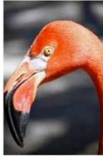
Positive Negative Contrast