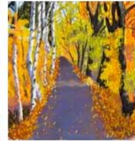
4. Autumn Afternoon