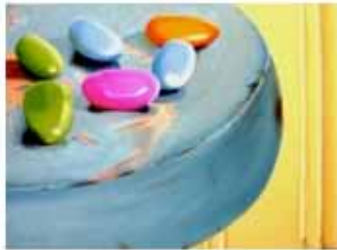
6. Easter Morning