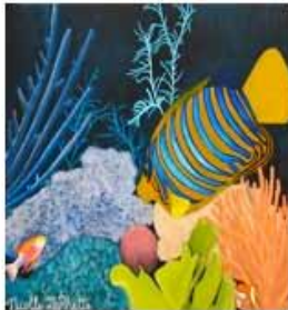
5. Sea My Favorite Fish