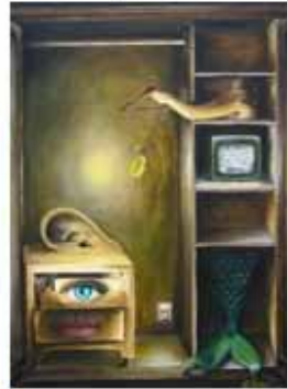
7. Magician's closet