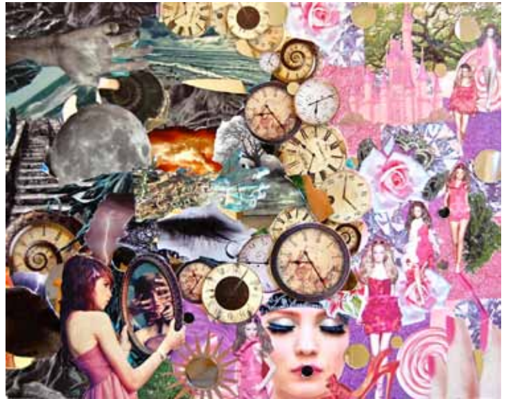
Catie Veilleux-Grade 12 The Truth is not in the Mirror, it is Within You Mixed-Media Gold Key