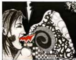
6. Frustration in its Best Design