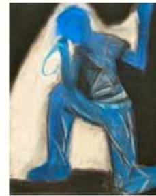
4. Blues Shines in the Light