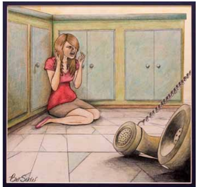
Colored Pencil Silver Key