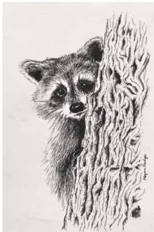
Megan Dodge Grade 9