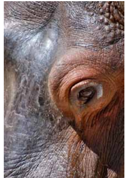
Maggie Cook-Grade 12 Focal Point Digital Photography Honorable Mention