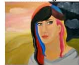
8. The Colors of Her Life