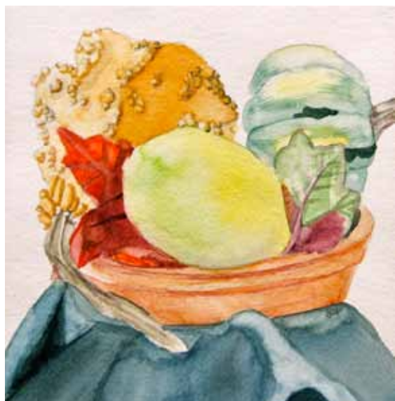
Erin Hussey-Grade 10 Harvest Water Color Painting Honorable Mention