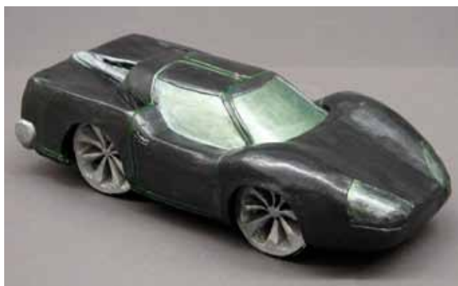
Neil Hadley Grade 9 Capturing Diagonal Planes Sculpture Honorable Mention