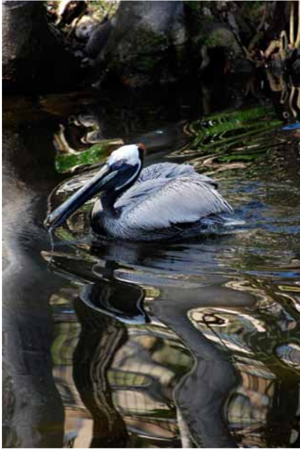
Maggie Cook-Grade 12 Blue Harmony