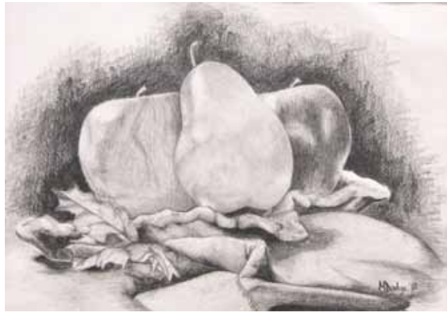
Megan Dodge Grade 10