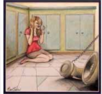
4. The call