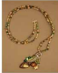
6 Frog Pond Necklace