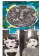
7. We are Watching