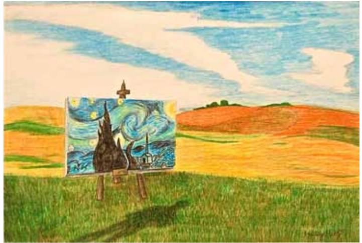
Haley Metz-Grade 10 Paint Your Palette Blue and Gold Colored Pencil Silver Key