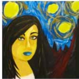
2. Blue Night