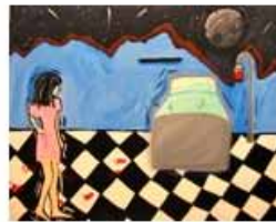
3. Blue Bedroom