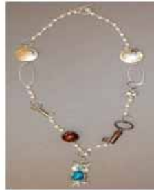
7 Antique Owl Necklace