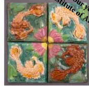
4 Koi pond with Lotus