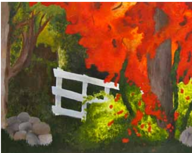
Audrey Comeau-Grade 10 By The Back Gate Acrylic Painting Honorable MentionKey