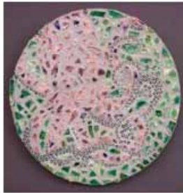
5 Abstract Octopus Mosaic