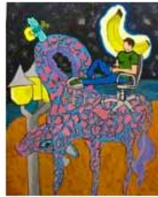
3 Twilight Stroll Through my Dreams