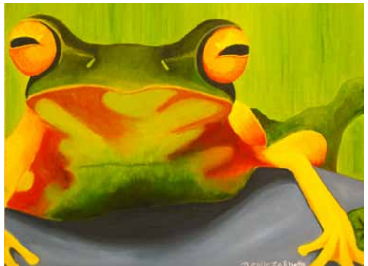
Oil Painting Honorable Mention