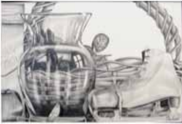
1. Reflective still-life