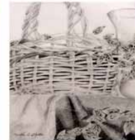
7. Color and Value