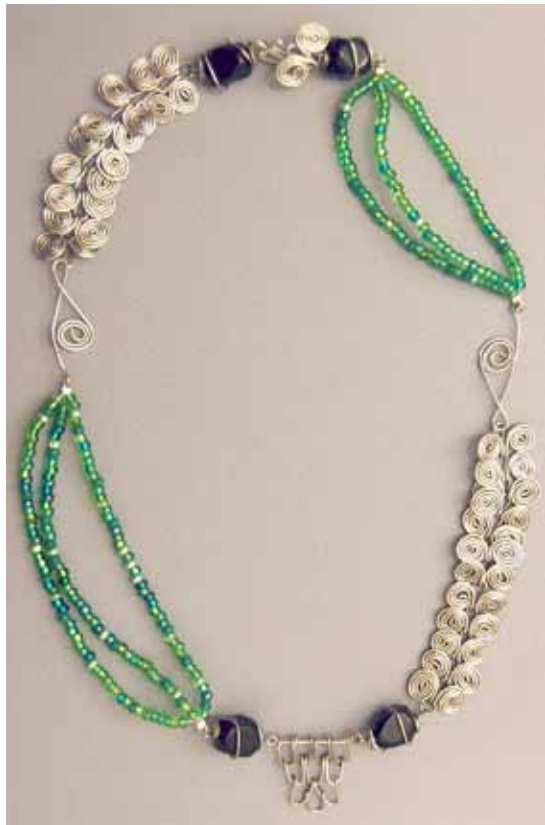
Krista Wagner-Grade 11 Spiral Ode Egypt Jewelry Gold Key