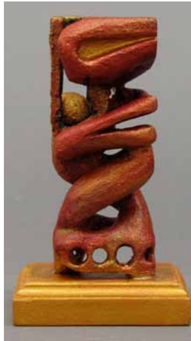
Neil Hadley-Grade 9 Carnival Ride Sculpture Silver Key