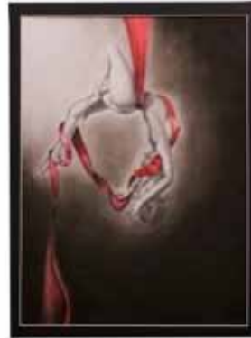
3. Tangled Starlet