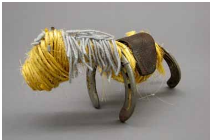
Emma Downing-Grade 10 Doodles Sculpture Gold Key