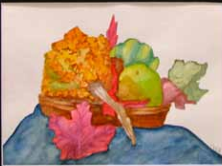
Caitlyn Boutin- Grade 10 Seeing Double