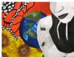
5. How beautiful our Lovely Earth