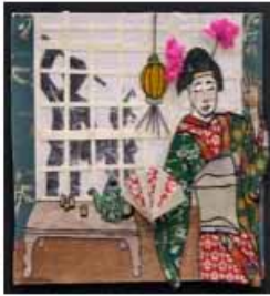
1 Hidden Suffering

$500 a year for four years New Hampshire Institute of Art Scholarship