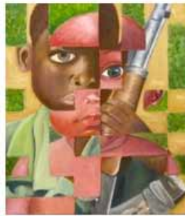
2. Child Soldier: Parody of a Man