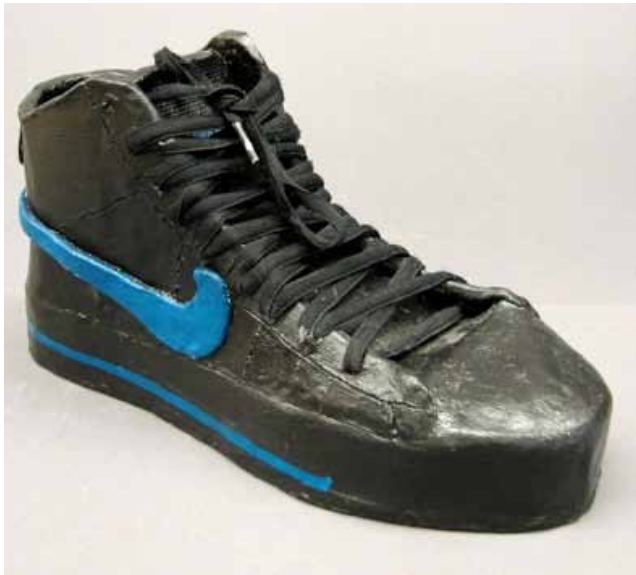
K Solomon - Grade 10 Niki SB