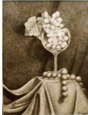
2. Before the wine