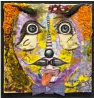
5. More than meets the eye