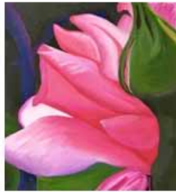
2 Peony in Bloom