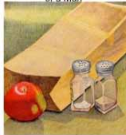
6. Lunch Time