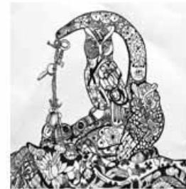
8 Eclectic Owls